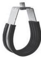
Sprinkler Clamp with neoprene insulation