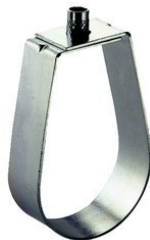
Galvanized sprinkler clamp

Available in a variety types which fit to different applications, clamps with neoprene insulation reduce vibration in the pipes, they are also used as electric current isolators; the clamps with adjustment screw allow the installation of different pipe configurations.